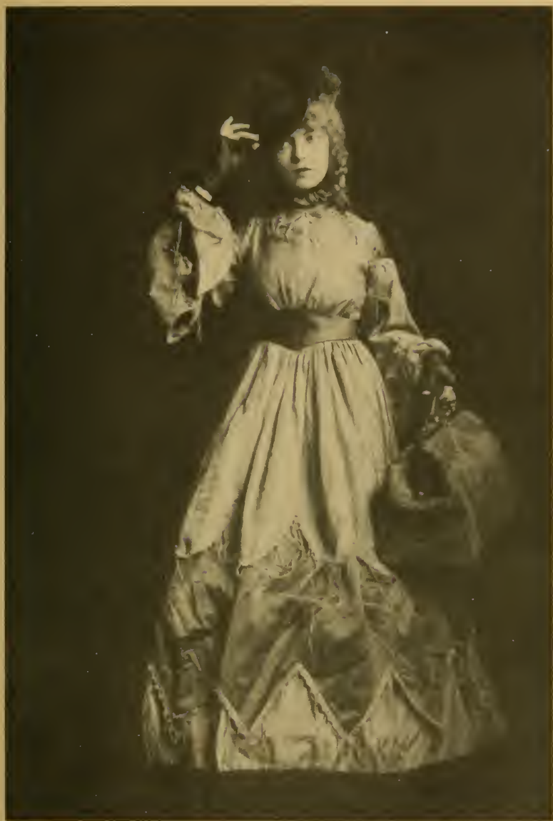
LILLIAN AS ELSIE STONEMAN, IN "THE BIRTH OF A NATION"